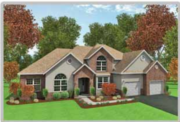
TOTAL LIVING AREA 3,219 SQ.FT.

NUMBER OF FLOORS: 2 GARAGE: 2 BEDROOMS: 4 BATHROOMS: 2.5