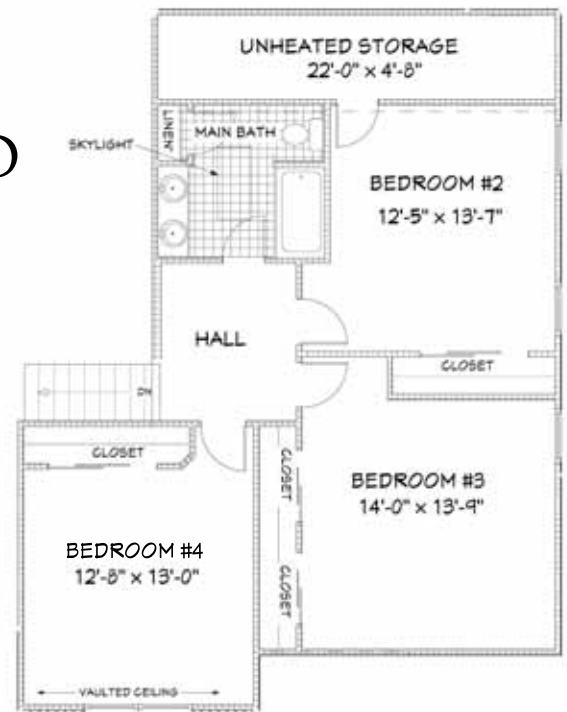
SECOND FLOOR (840 SQ.FT.)