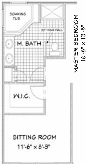
OPTIONAL MASTER BATH